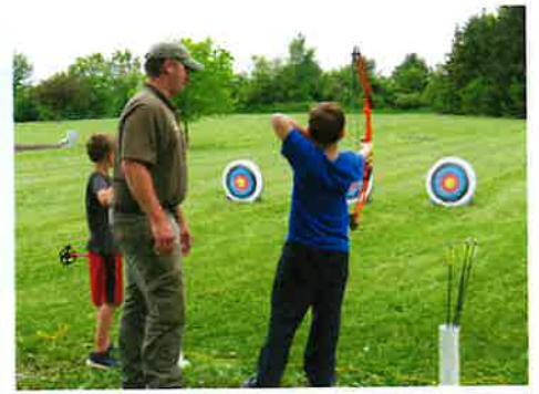
METROPARK EXPLORERS (AGES 10 to 14)

Youth, ages 7-9 years old, are welcome to join in the fun as explore the wonders of nature! Please bring a sack lunch and water bottle. Dress to be outdoors. Registration along with a non-refundable $15 fee is required by July 14.