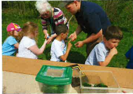
METROPARK DISCOVERERS (AGES 7 to 9)

Youth, ages 5 and 6 years old, will learn about the importance of taking care of the world around us. The fun will include games, stories, crafts and hikes. Please bring a sack lunch and water bottle. Dress to be outdoors. Registration along with a non-refundable $10 fee is required by July 6.