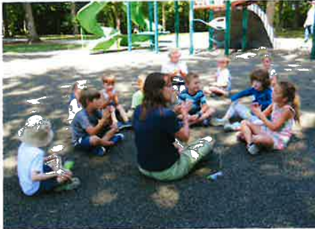
METROPARK TRAILBLAZERS (AGES 5 & 6)